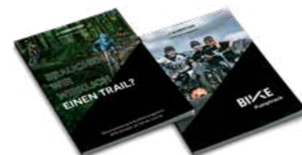
Do we really need a trail?