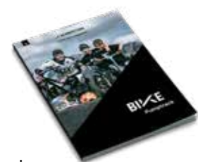
Bike Pump track