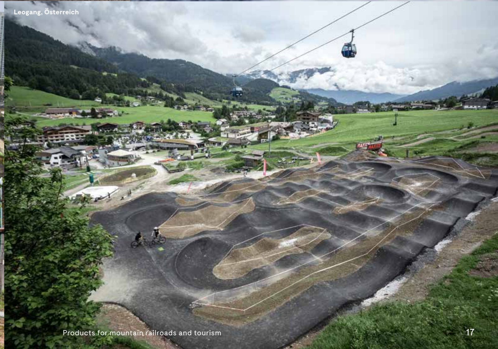
Products for mountain railroads and tourism